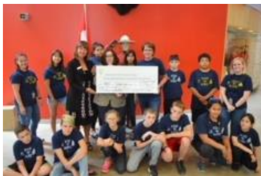
SouthSask Community Foundation Cheques presentation $9,000.