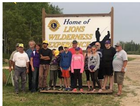
Lions Wilderness Experience