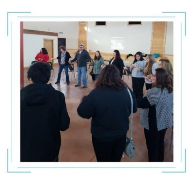
ENGAGING YOUNG LEADERS KEESEEKOOSE FIRST NATION