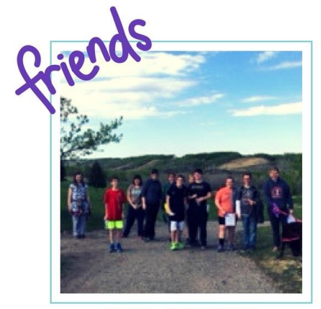
CLUB CONNECT TEN WEEK AFTER-SCHOOL PROGRAM | ESTERHAZY