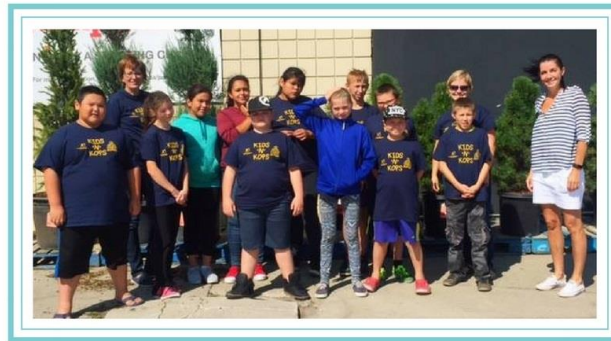
KIDS N' KOPS | YORKTON