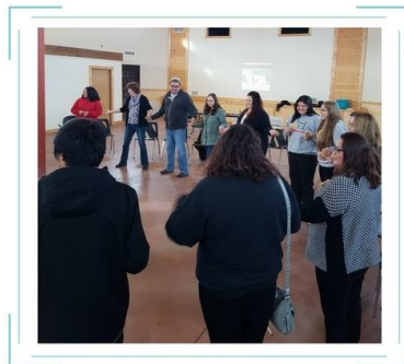
ENGAGING YOUNG LEADERS KEESEKOOSE FIRST NATION