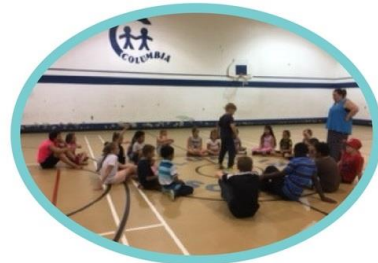
COMMUNITY CONNECTIONS: KIDS IN ACTION SUMMER PROGRAM | YORKTON