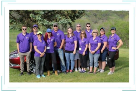
GOLF 'FORE' KIDS SAKE CADDIES