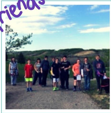
CLUB CONNECT TEN WEEK AFTER-SCHOOL PROGRAM | ESTERHAZY