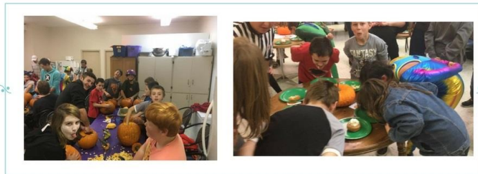
BIG BUNCH HALLOWEEN PARTY