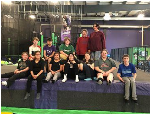
Club Connect After School Program