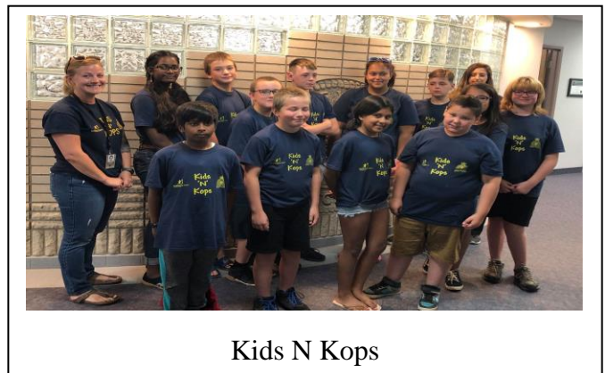
Kids N Kops