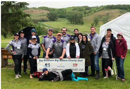
Golf For Kids Sake 2019 Caddies

Bowl For Kids Sake Top Pledge Raisers Thank you