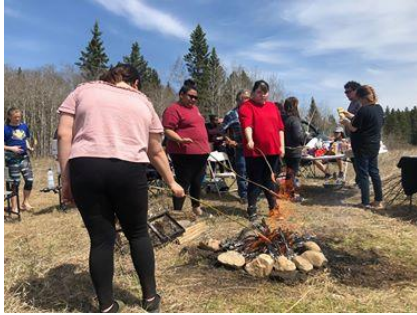
Engaging Young Leaders Land Based Teachings