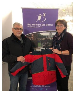
Coats for Kids Knights of Columbus