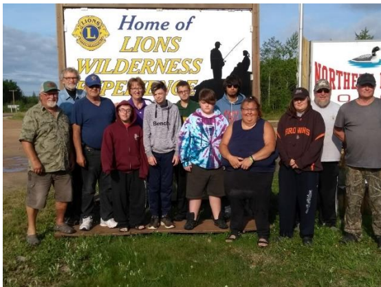
Lions Wilderness Experience 2019