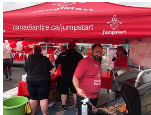
Canadian Tire Jumpstart BBQ