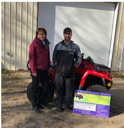
Winner of the ATV Draw 2019