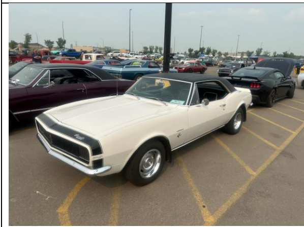
Best Clean N Shine-Bob Suschinsky